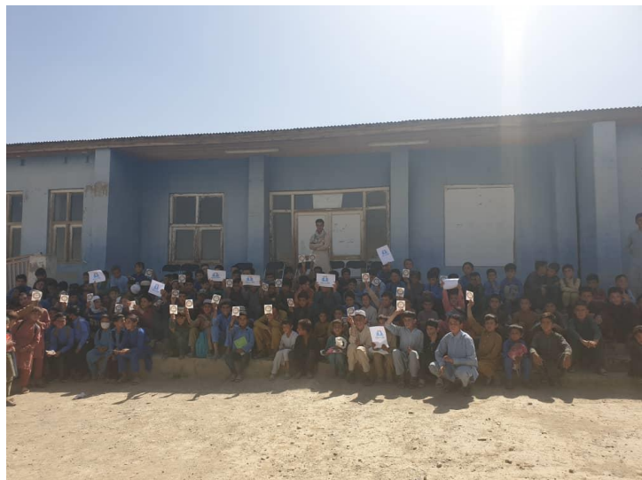
Shahid Shamali Khan High School Boy Students