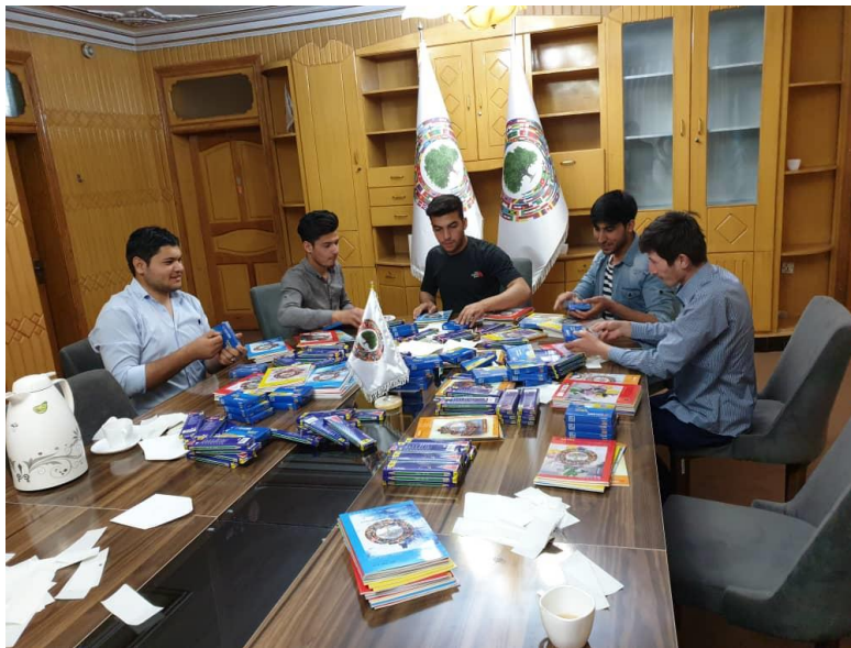
Figure 4: Checking & Repacking, WOF office

Though stationery was difficult to procure during the COVID-19 pandemic, the team nonetheless managed to procure the best quality for students.