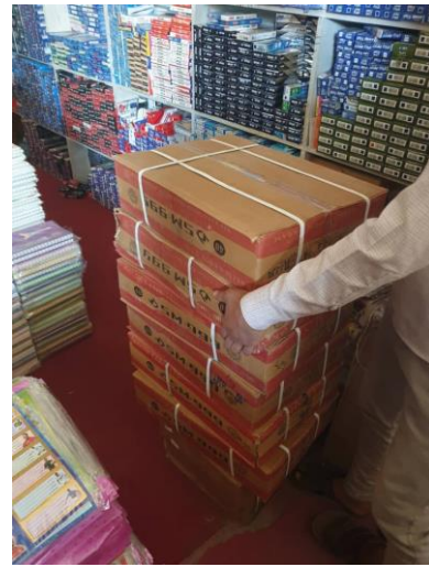
Figure 3: Stationery Shopping, Mandawi, Kabul. June 16