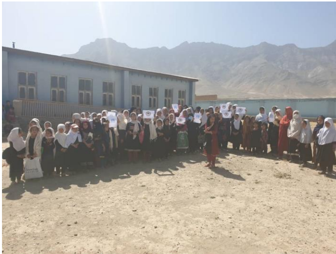
Shahid Shamali Khan High School Girl Student